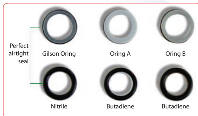
Figure 3: The level of elasticity based on the ASTM test method is 80 shores for the PIPETMAN® O-ring compared to only 70 shores for the counterfeit ones. When the hardness of the seal is increased, its resistance to deformation is also increased resulting in cracks.

Another side effect engendered by the use of counterfeit tip-holders is that unprincipled service centers who indulge in counterfeit parts are tempted to re-interpret procedures to their advantage. Simply, they adapt them. For example, the Gilson Pipetman® is a one-of-a-kind pipette resorting to a dry seal system to obtain perfect air tightness. Precision engineered parts are mandatory to ensure a perfect fit between parts. Putting grease to fill gaps between look-alike, cheap parts to